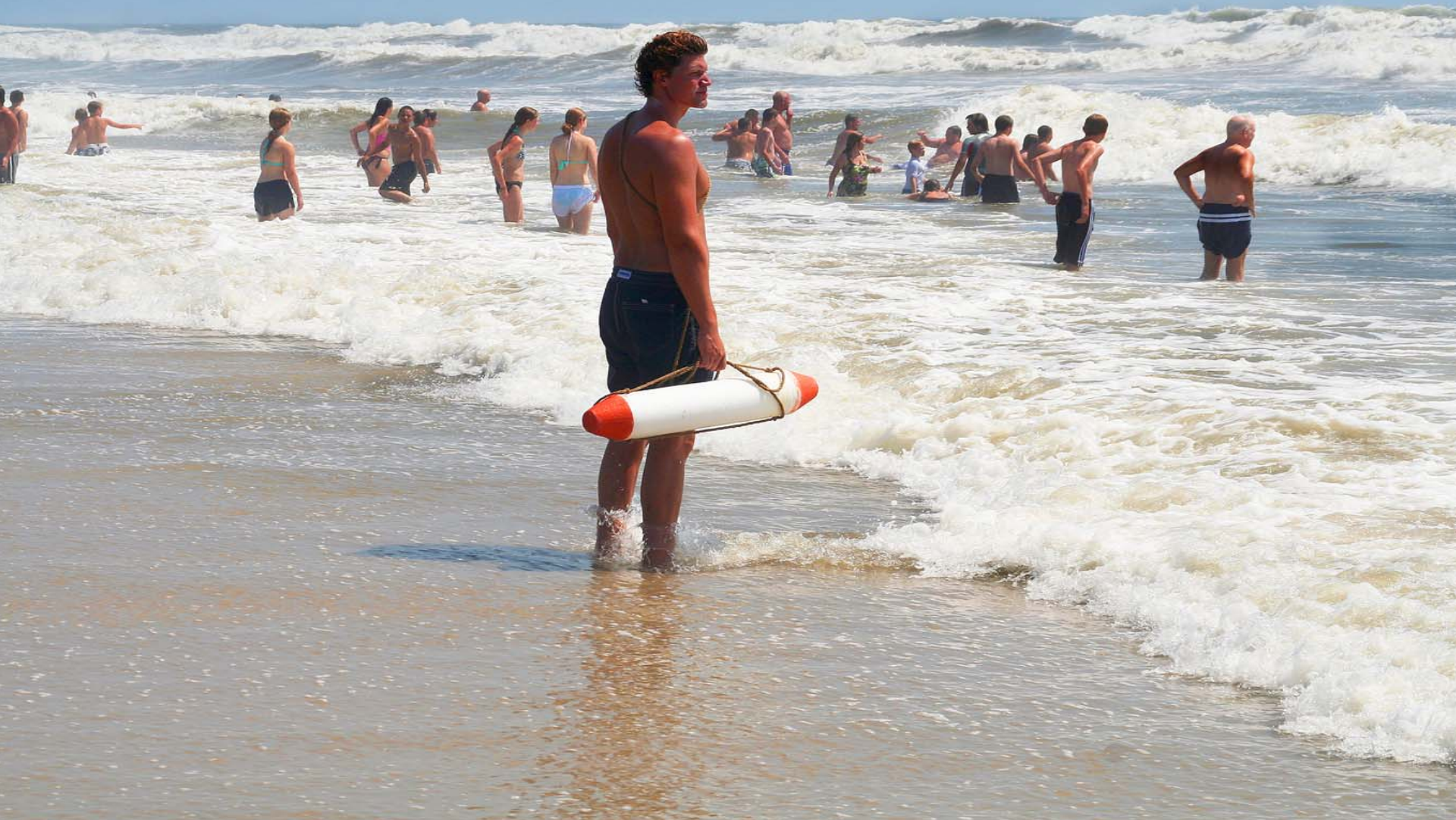
On rough days, walking patrols augment lifeguards in wingstands.