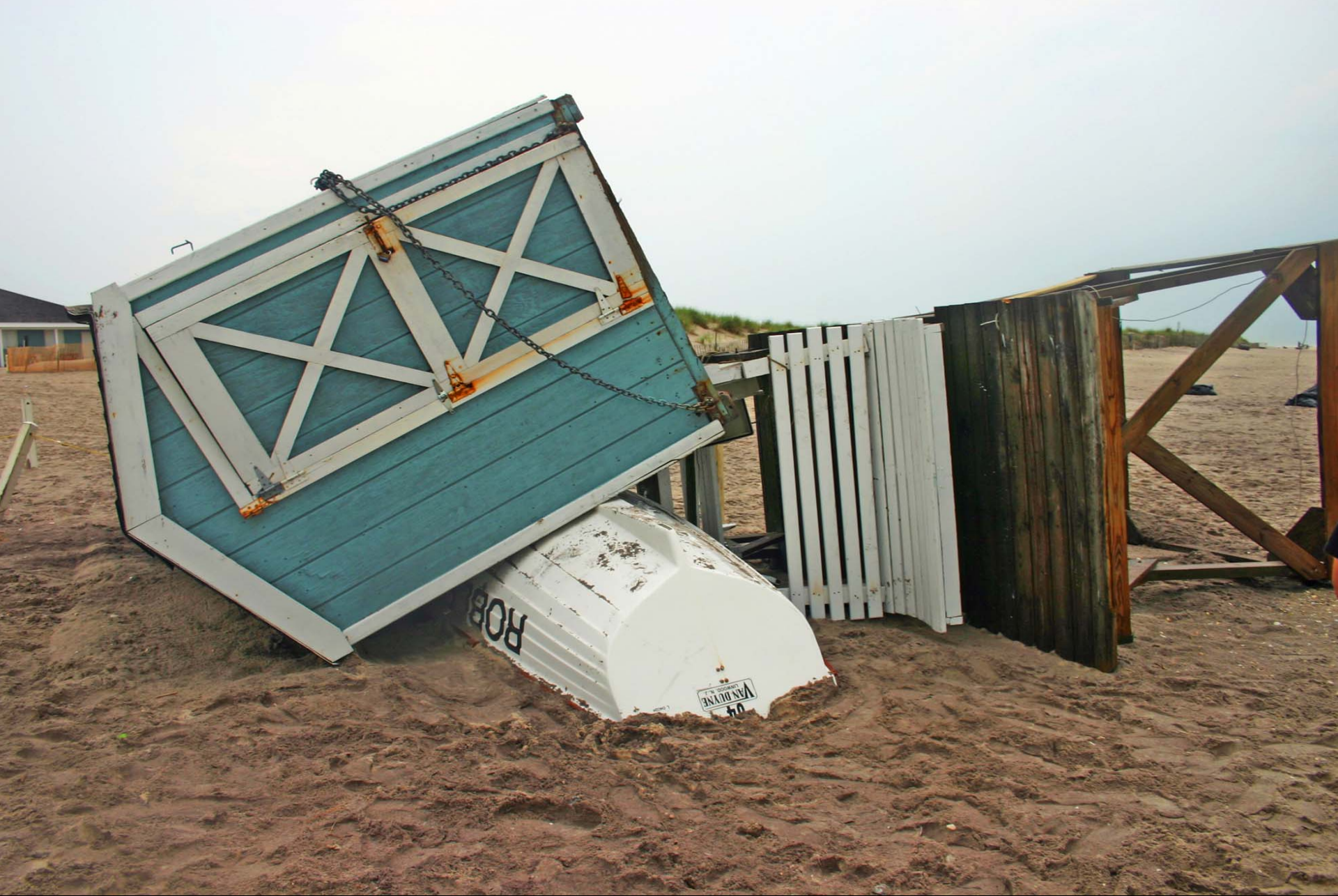
"Cyclonic event" at Robert Moses St. Park